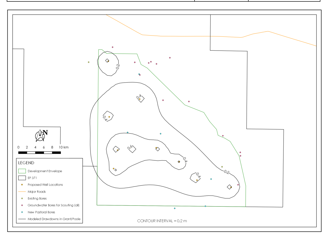
Figure: Mod 2 model results presented as drawdown contours after six months of pumping with contour interval = 0.2 metres (Intera model)

The results from Mod 1 indicate that abstraction of the required water volumes will not result in any noticeable impact to existing bores, and that the nearest GDE (Mount Hardman Creek or the Fitzroy River) are too far to experience any significant impacts.