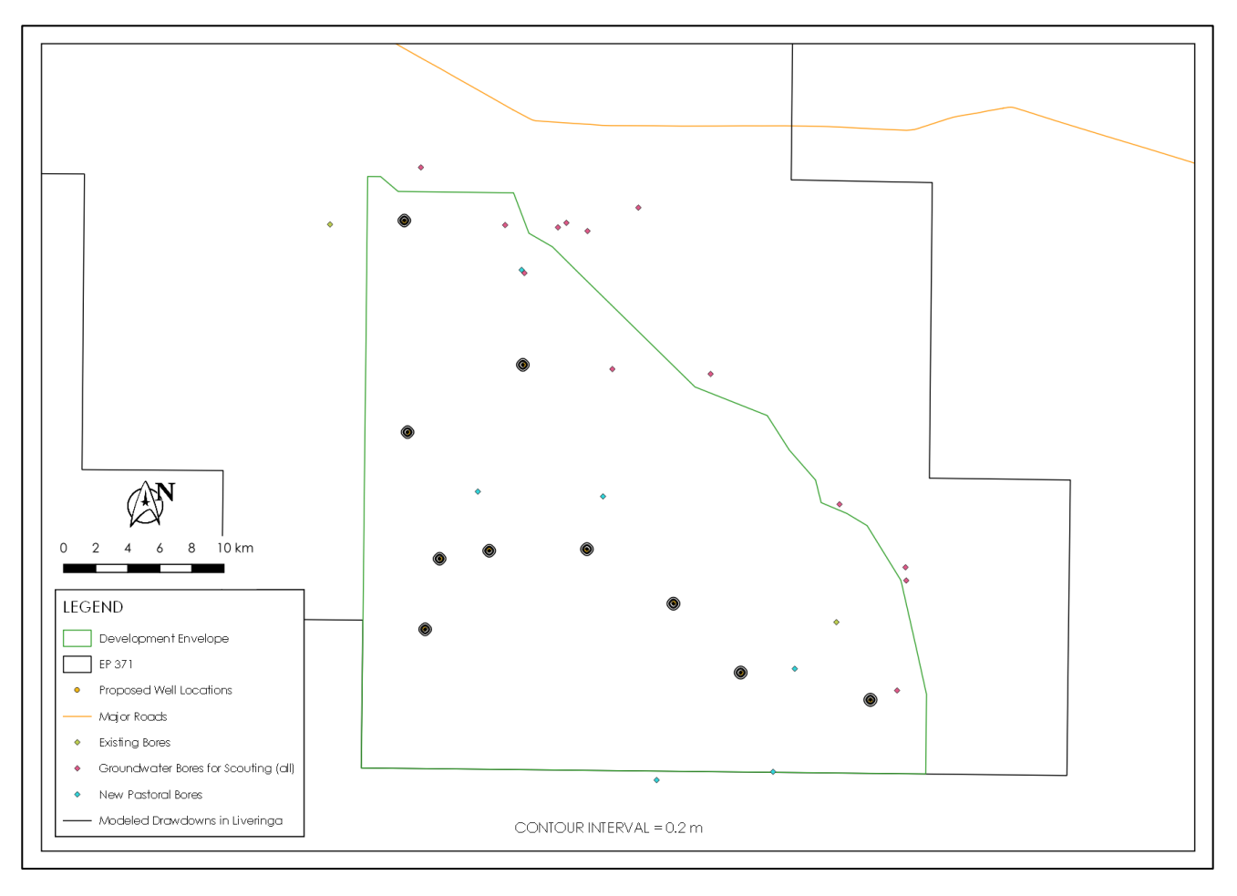
Figure 2-2: Mod 1 model results presented as drawdown contours after six months of pumping, with contour interval = 0.2 metres (Intera model)